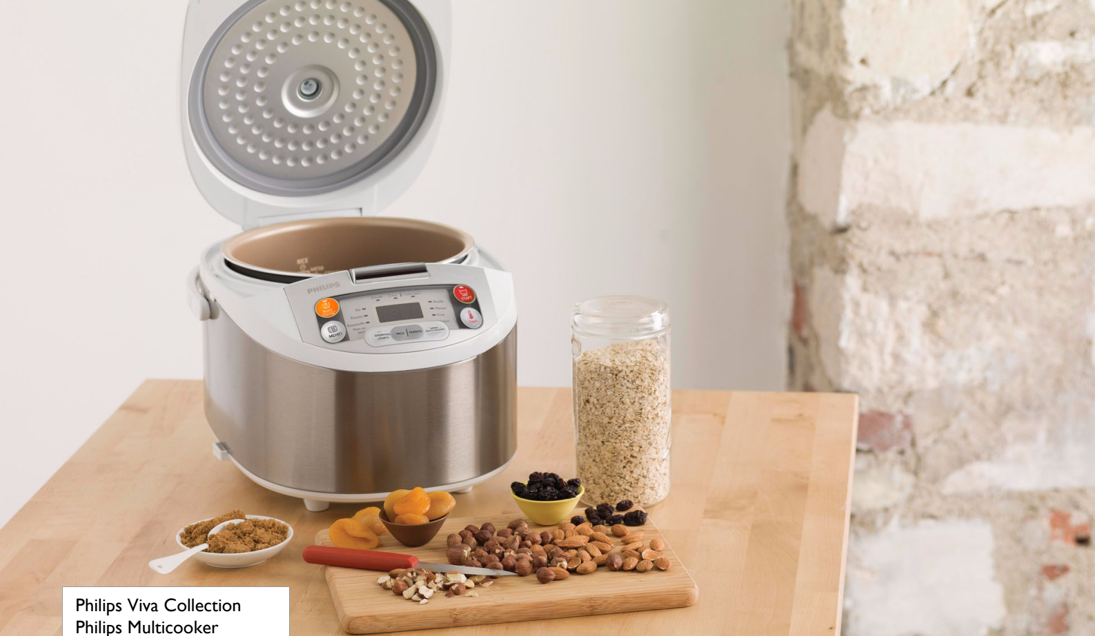
Philips Viva Collection Philips Multicooker